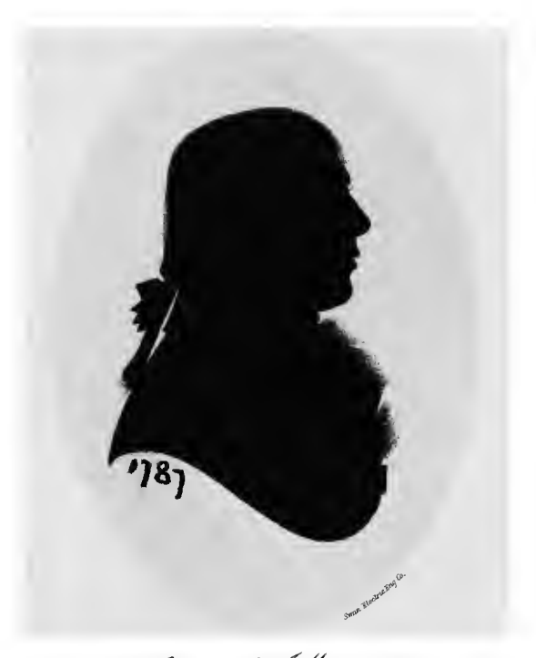
Silhouette by I. Miers : 1787. | The Scottish Mational Portrail Gallery: 4 by 2 ½ in ]